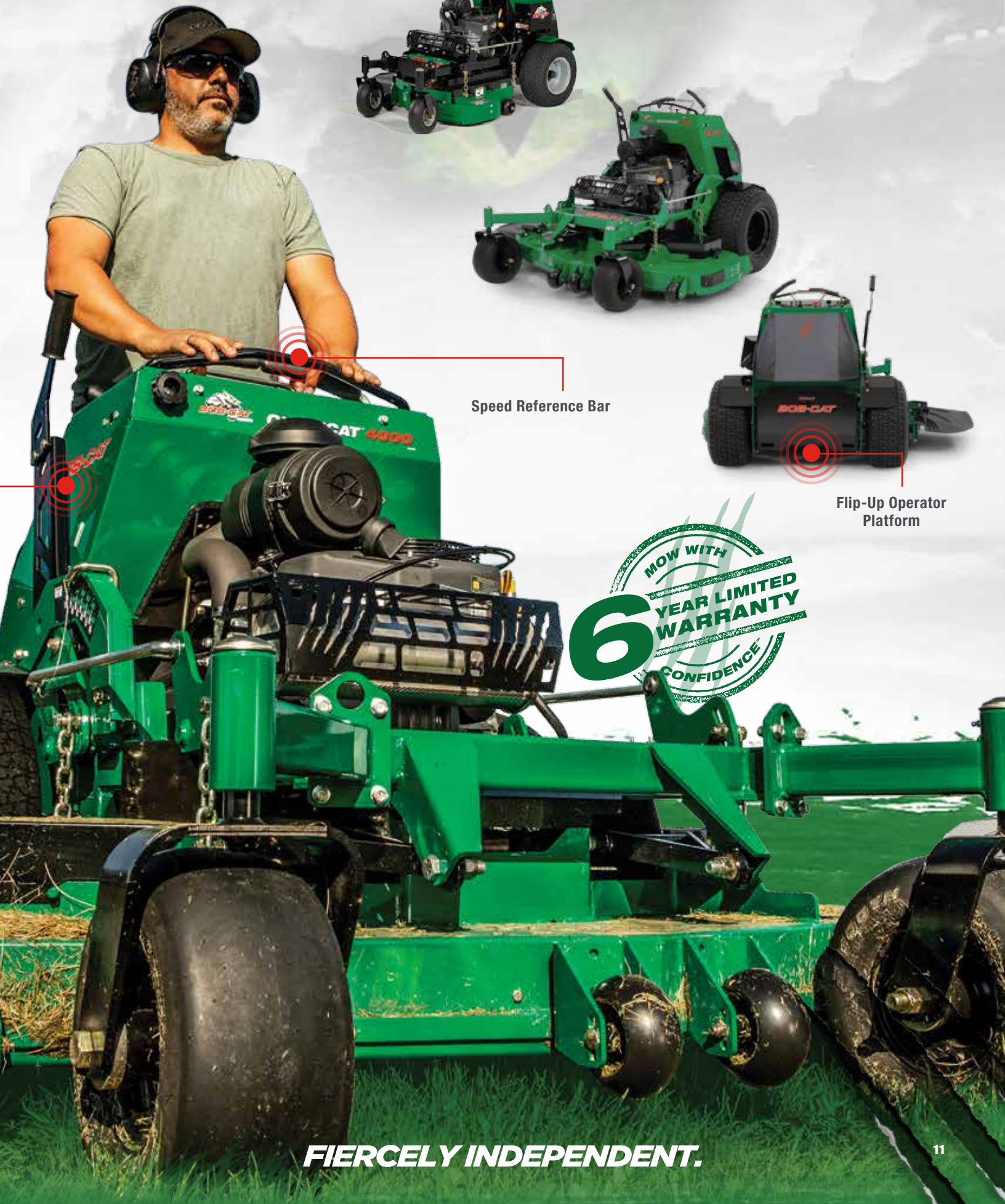
Speed Reference Bar