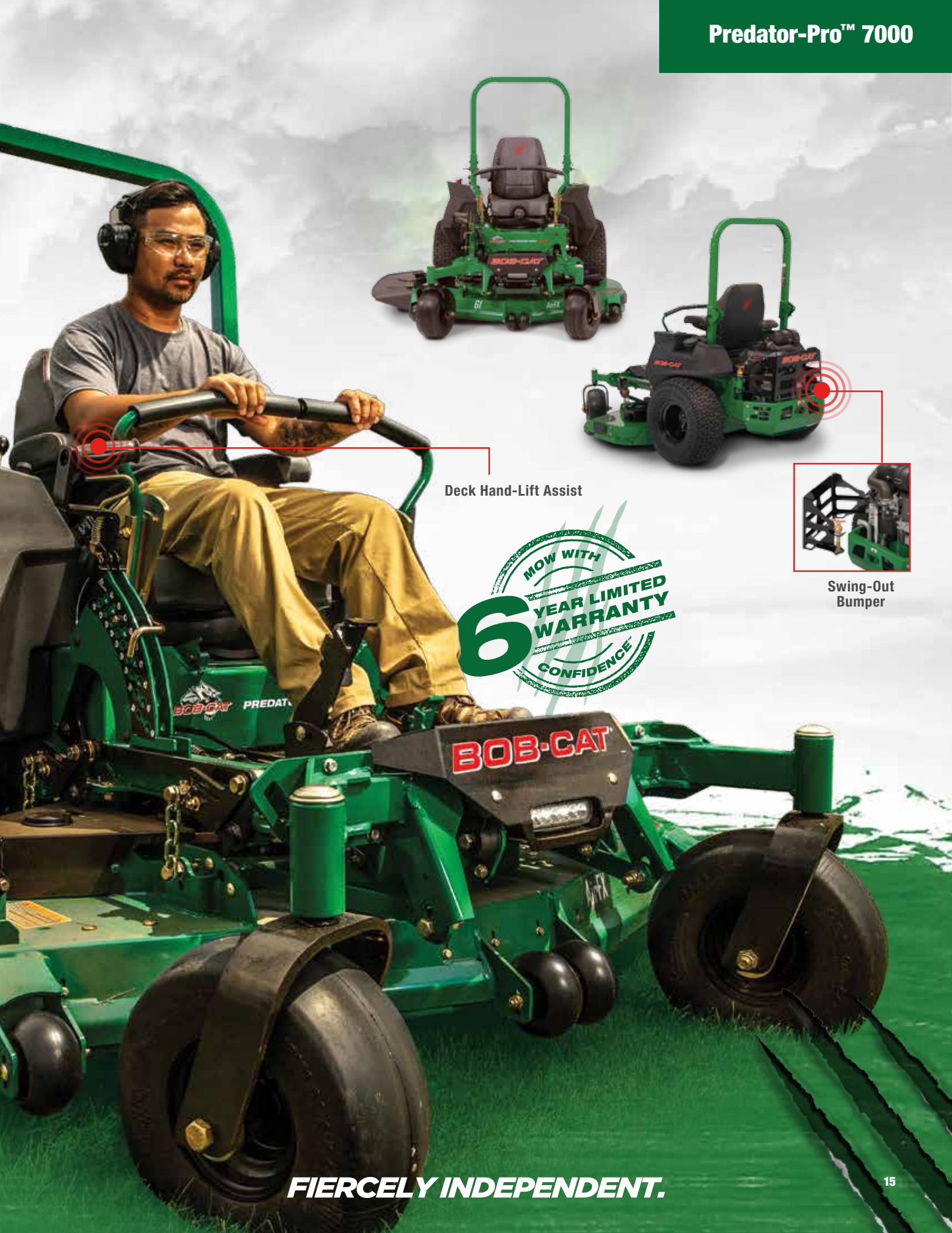
Deck Hand-Lift Assist